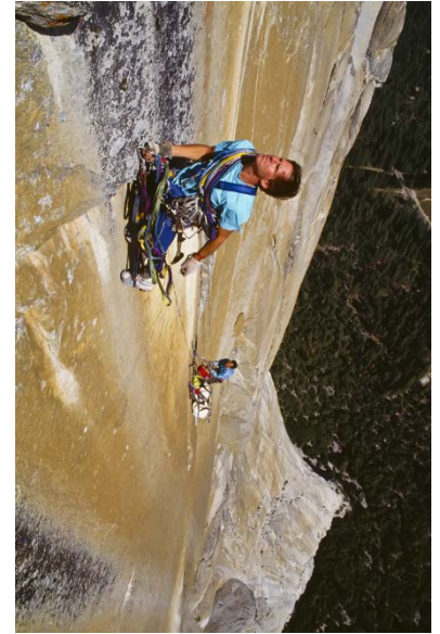
Figure 1: Is Your BHAG as Humbling as El Capitan? Read the Blog

And in the case of suicide, it means setting a goal of ZERO DEATHS.