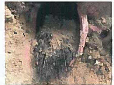
Tree roots from a private service line grew into Utilities' sewer main and created backups.

If you have concerns (and especially if there are big trees on your property that could lead to damage), you may want to contact a plumber to assess the condition of your sewer lines and establish a regular maintenance program, just as you do for your vehicle.