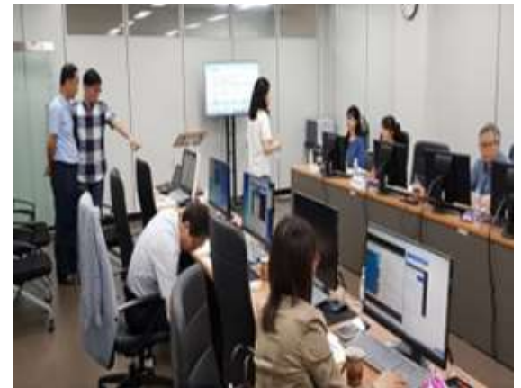
offline-> Online evaluation