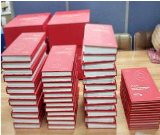
Printing cost - > Zero