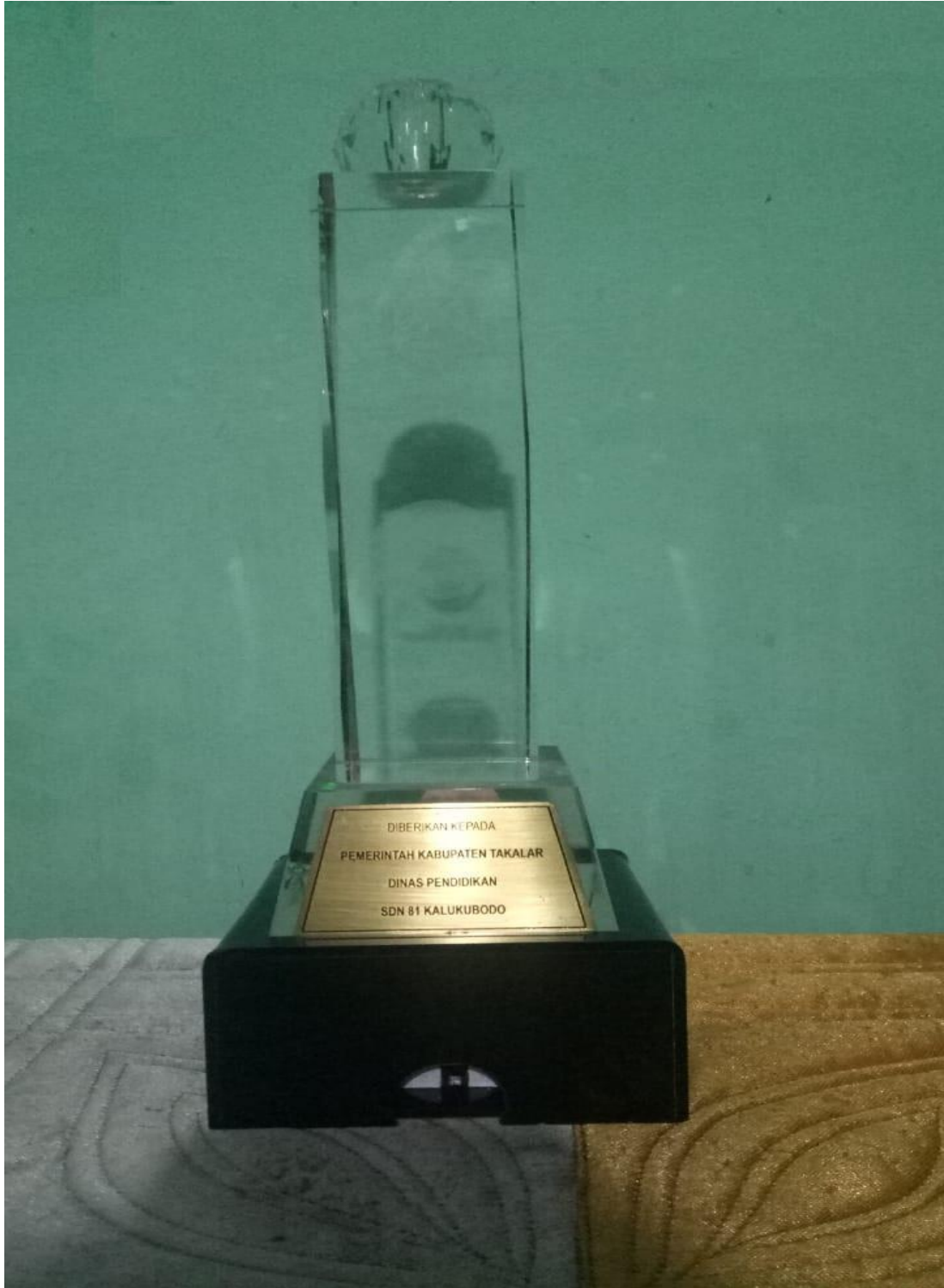
TROPHY TOP 40