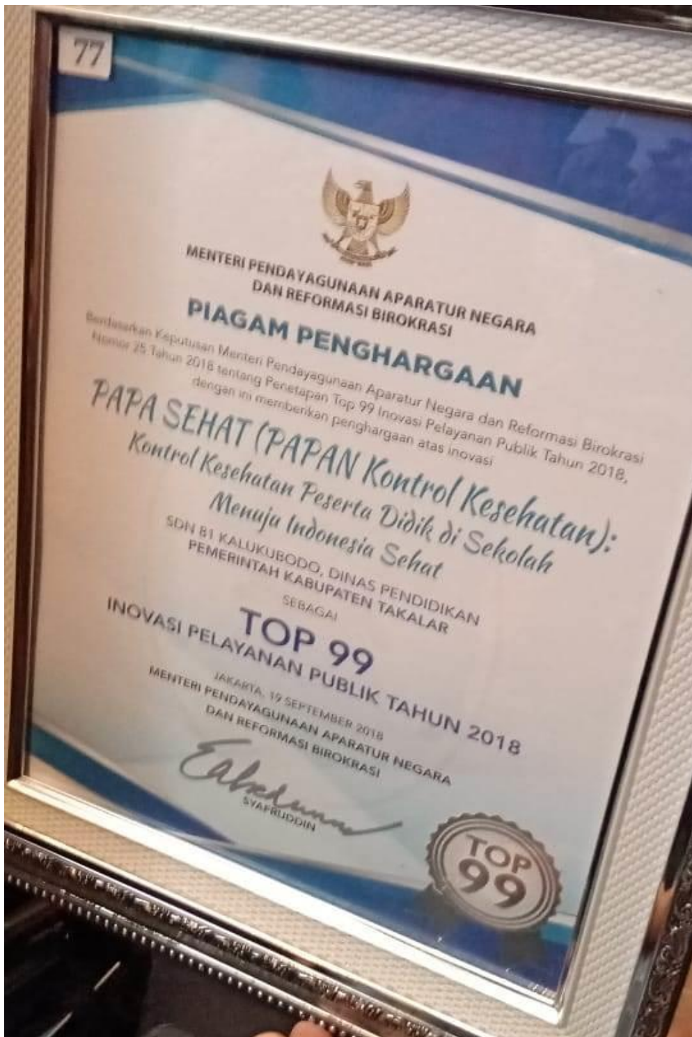
AWARD CERTIFICATE TOP 99