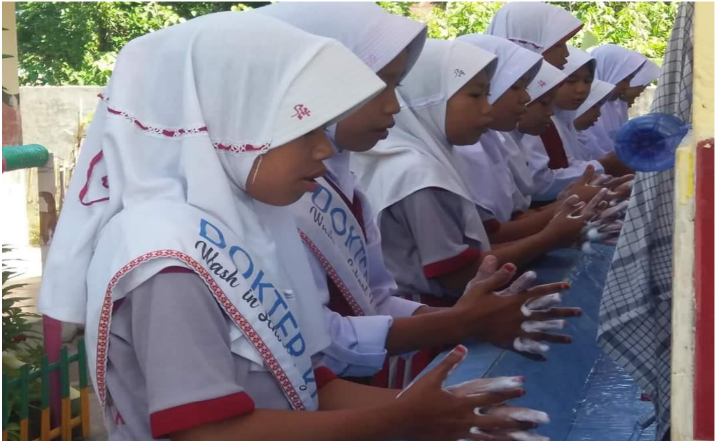
Hand Washing With Soap (CTPS)