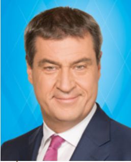
Markus Söder, Prime Minister of Bavaria