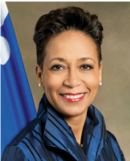
Nadine Girault Minister of International Relations and La Francophonie, Minister of Immigration, Francization and Integration of Québec

"Home to global health organizations like the U.S. Centers for Disease Control and Prevention (CDC) and the Task Force for Global Health, renowned research institutions like the Georgia Institute of Technology, and nearly 700 research testing and medical labs, the effects of innovation in Georgia are felt around the world. The state's global partners, in both the private and public sectors, fuel this innovation and progress."