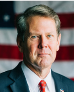
Brian Kemp, Governor of Georgia

"Corona is a game-changer. Never before have politics and science been that interdependent."