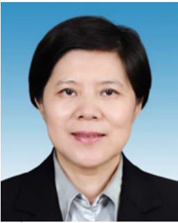
REN Airong, Vice Governor of Shandong

"São Paulo: measures to combat the Coronavirus and to foster the post pandemic sustainable recovery."