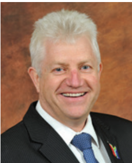
Alan Winde, Premier of the Western Cape

"友城结同心·科技助战疫" "Strengthen Solidarity and Defeat the Virus with Technology."