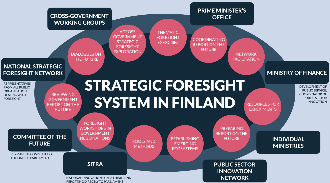
Figure 3 Outline of main components and activities in Finland's national foresight system