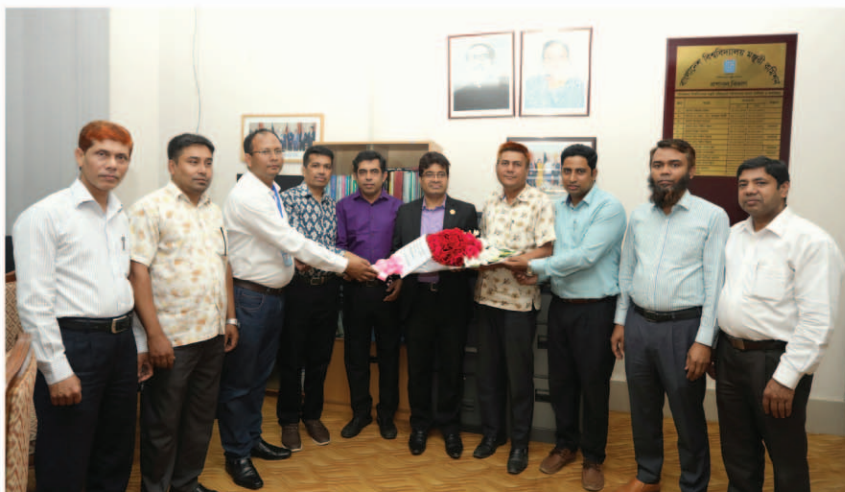
Director of Planning and University Grants Commission Development Division of (UGC) of Bangladesh Dr.