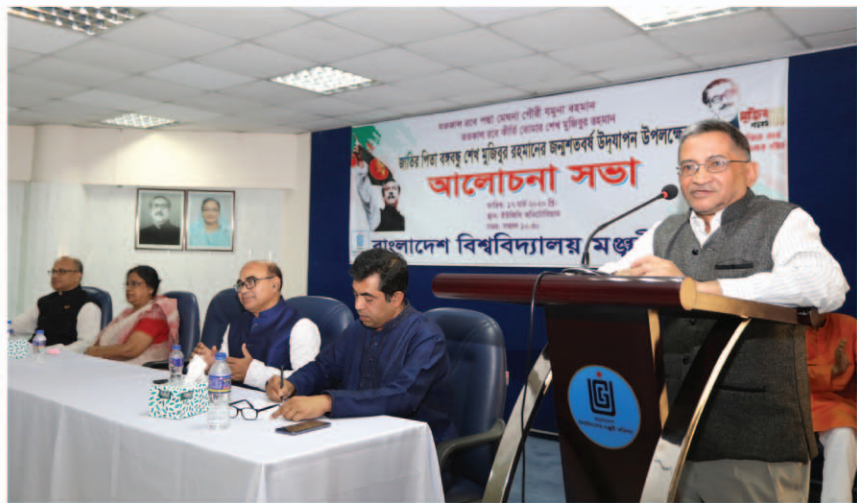
Bangabandhu Sheikh Mujibur Rahman at Dhanmondi 32 and mural of Bangabandhu set up at UGC.